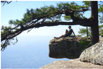
Phu Kradueng National Park