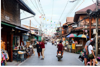
Chiang Khan walking street

I have been to Chiang Khan walking street .