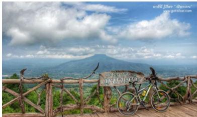
Phu Pa Po