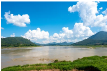
Kaeng Khud Khu