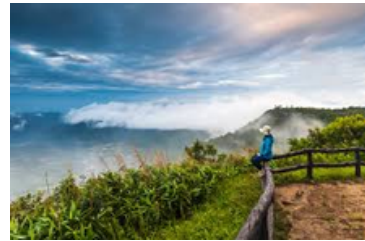
Phu Ruea National Park