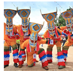
Phi Ta Khon Festival