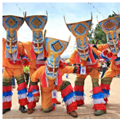
Phi Ta Khon