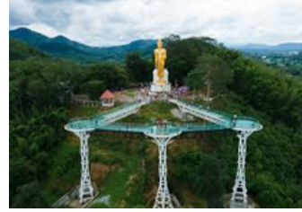
Chiang Khan Skywalk

I have been to Chiang Khan walking street .